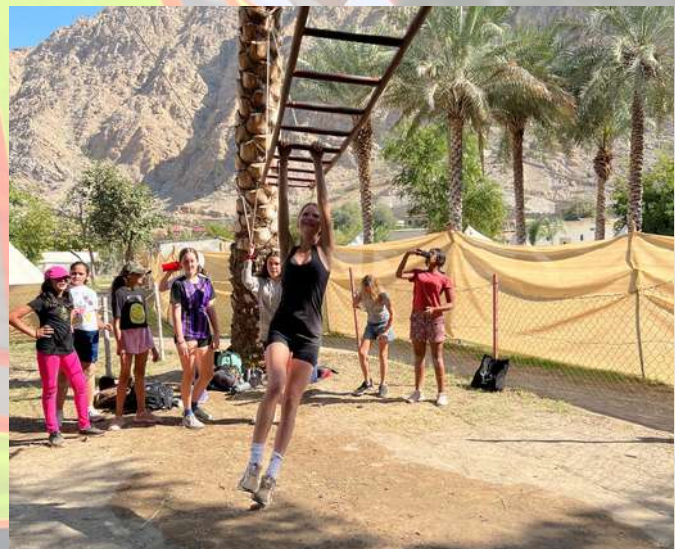
Secondary Residential Trip