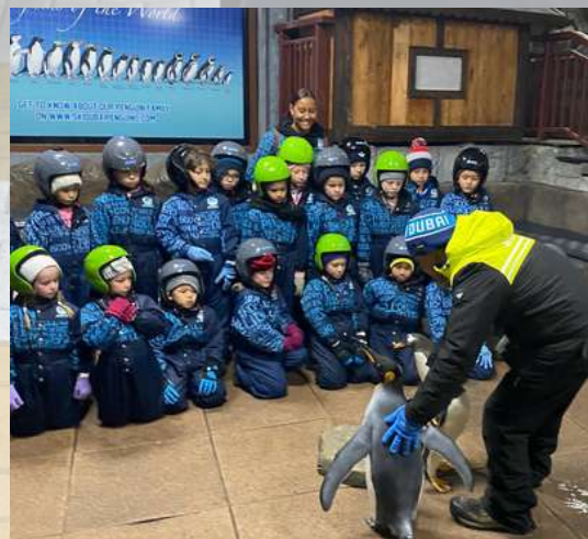
Year 2 Trip to Ski Dubai