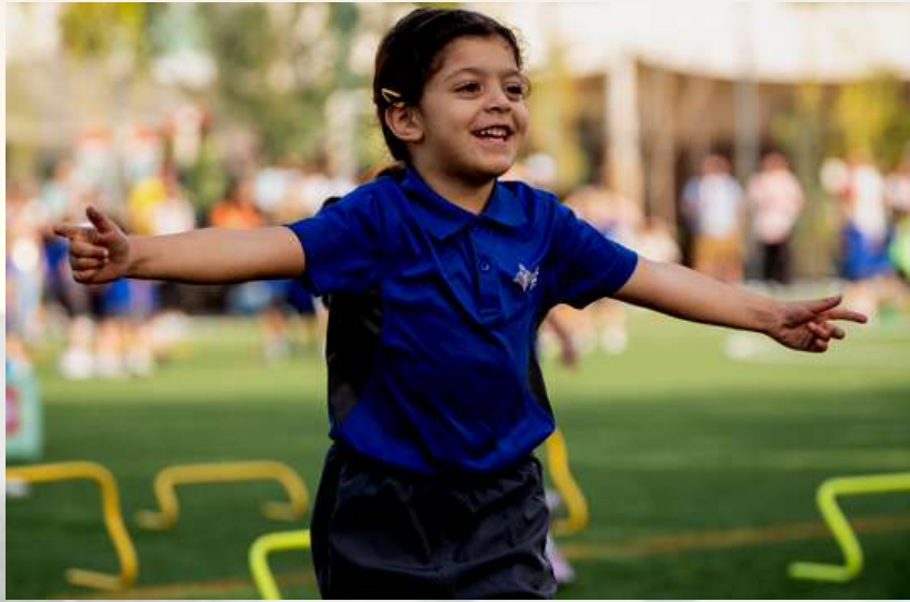
FS Sports Day