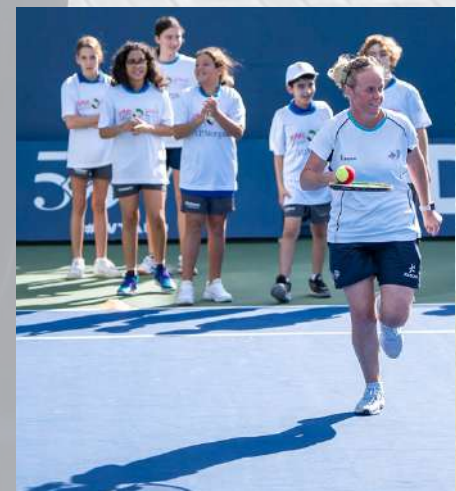
WTA Tennis Championship