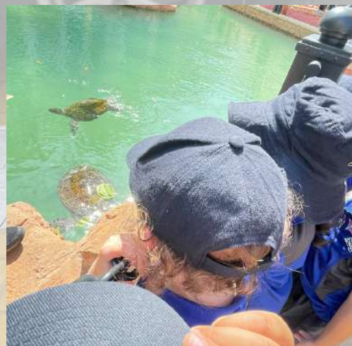
FS Turtle Trip