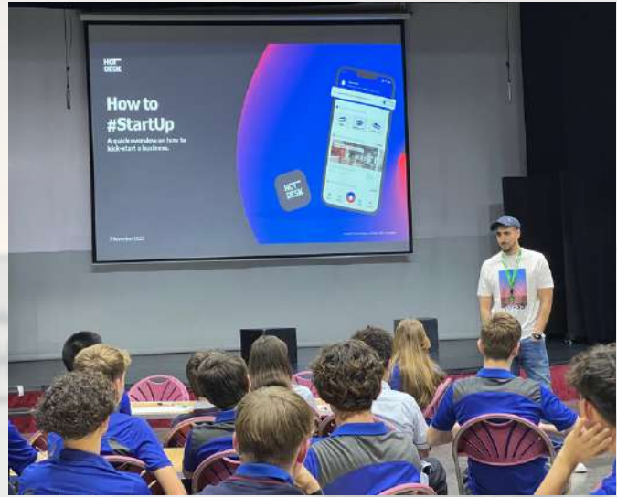
HotDesk Business Studies Visit